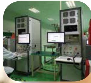
Our state-of-the-art facilities include an SMT machine, automatic plug in line and our TÜV testing laboratory.